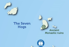
The Seven Hogs Ancient Monastic ruins