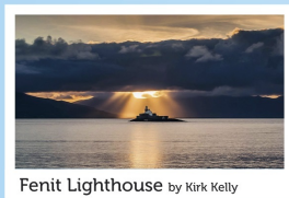
Fenit Lighthouse by Kirk Kelly