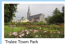
Tralee Town Park