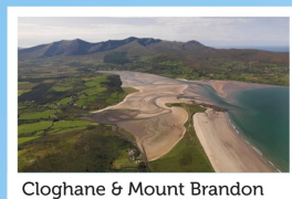
Cloghane & Mount Brandon