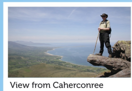
View from Caherconree